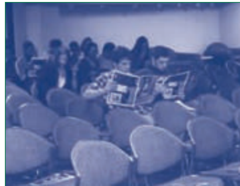
Students at Duke University pour over Did You Know? before the event starts.