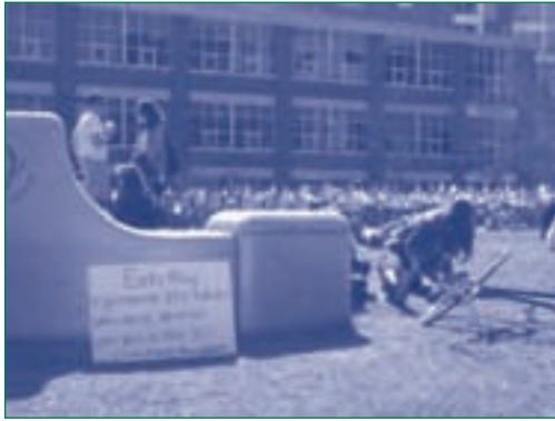
Northeastern's Memorial of Innocents flag display (1 flag=1,000 babies a year)

To learn more about impacting your campus for life, contact HLA at 651-484-1040 or visit www.humanlife.org .