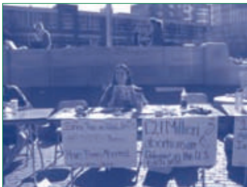
Northeastern's Table where they handed out icare... to fellow students.